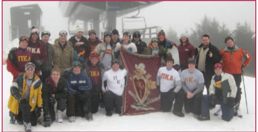
Delta Gamma traveled to Snowshoe Mountain in West Virginia for our annual ski trip. A good time was had by all.