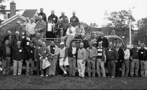
Pikes from 1967 to 1971 gathered for a reunion in Oxford, October 21-23.