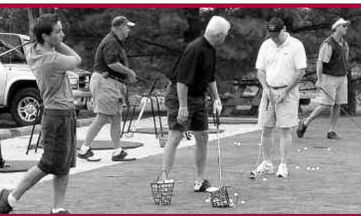
Brothers warm up on the driving range.