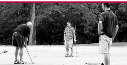
Everyone had a good time—and challenge—on the putting greens.