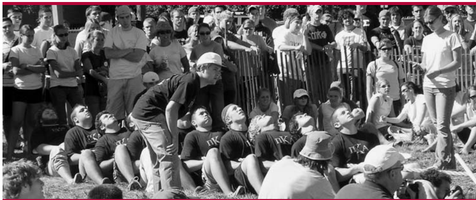
Pikes competing in Puddle Pull contest.

The brothers currently participate in many intramural sports, both inside and outside the fraternity leagues. We fielded teams for the soccer season earlier this fall and are working to increase our records in the ongoing flag football and hockey leagues. Our hockey team—the pride of our chapter's athletics—plays in the hotly contested Division 1 intramural league. This league contains some of the best from the entire Miami University community. "We are looking to go to the playoffs this year, but either way, it is a